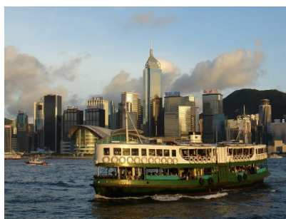
The “Star” Ferry Company