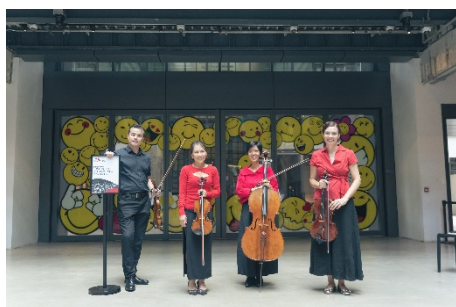
String Quartet Busking Performance